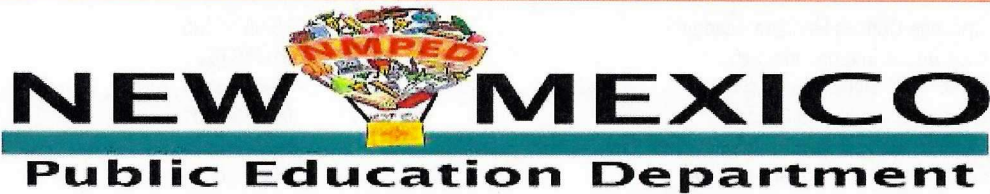
EXHIBIT B (24346 - FINAL FY22-23)